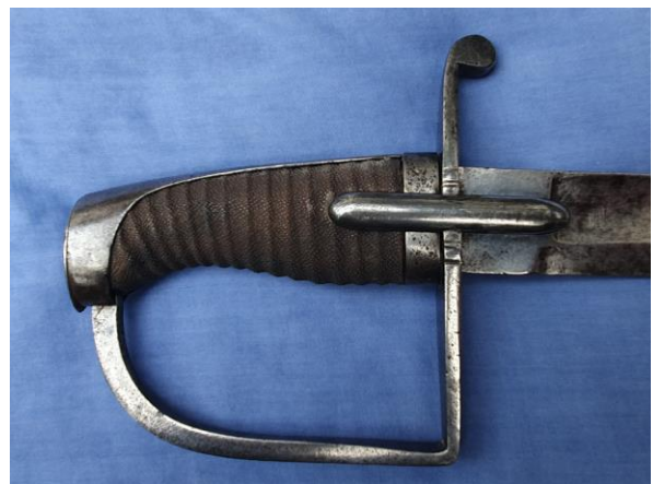
Plate 6. Light cavalry trooper.