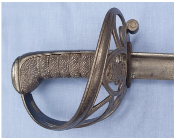
Plate 44. Type 4, circa 1830.

In 1827 Rifles officers dispensed with the Pattern 1822 infantry sword and adopted a new pattern. This was in steel, rather the brass/gunmetal of its predecessor, and initially utilised a Type 4 backpiece and later Types 5 and 6 with stepped pommel. The basic design of the guard remains in use today, although circa 1895 the form of the backpiece changed to a Type D.