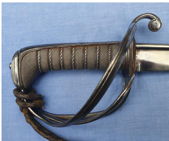
Plate 14. Light cavalry, circa 1825.

Narrow tapered back and a slim elongated shallow 'stepped' pommel (see also plate 21). Plain thumb-rest.