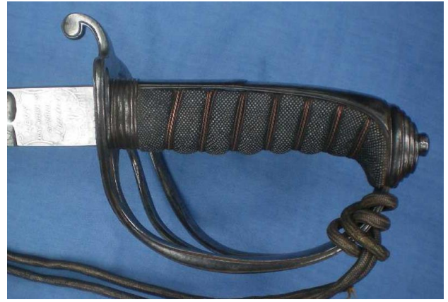
Plate 2. Royal Artillery, circa 1855.