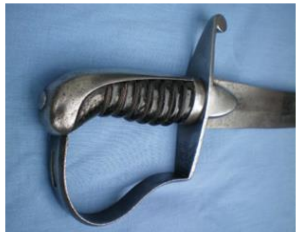
Plate 10. Light cavalry. Plain backpiece with no ears.