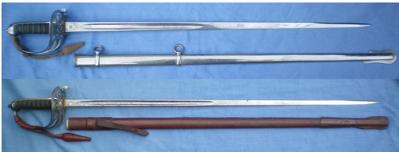
Plate 69. Pattern 1854/92/95 Foot guards.