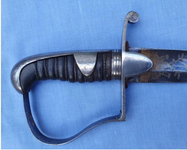
Plate 7. Light cavalry. Plain backpiece with 'shield' ears.

Broad back, sometimes faceted (i.e. incorporating decorative flattened areas). Usually, but not always, incorporating ears through which a rivet was passed to strengthen the hilt. For light cavalry, the ears are found in many forms but amongst the more common styles are: rounded, shield-shaped (i.e. slightly pointed), so-called 'comma-shaped', or in the form of a teardrop. Pommels were normally rounded, and usually either plain or exhibiting a continuation of the faceting on the back, if present. Note that heavy cavalry examples mainly exhibit 'comma' ears, and also faceting.