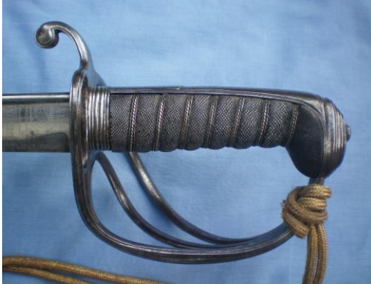
Plate 55. Cavalry officer's hilt.

For officers these were usually decorated with annular fluting, as compared with those belonging to cavalry troopers' swords which were generally completely plain.