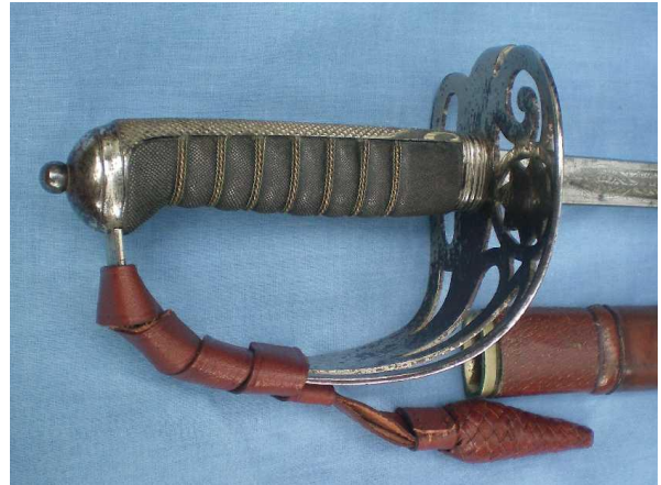
Plate 51. Foot guards, circa 1915.

In 1857 the Royal Engineers also adopted a new pattern, with a gilt brass or gunmetal hilt. Backpieces again generally followed the Type 6 cavalry form, with chequered thumb-rest and pommel. A tang nut is usually present. Not long after the introduction of the Pattern 1897 sword for infantry officers the Engineers lost their distinctive hilt, and circa 1900 were ordered to adopt the new infantry sword.