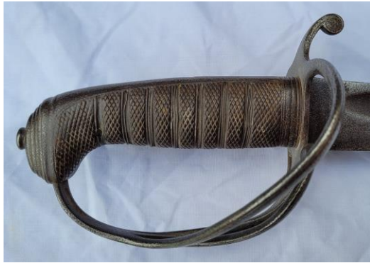
Plate 59. Light Cavalry.

Mention must also be made of the Patent Solid Tang/Hilt, which was a 'top of the line' option for those officers who could afford it. Introduced in the early 1850s, these employed slab grips made of synthetic material (perhaps gutta percha, or later either dermatine or gryphonite) which were fixed to the full-width tang using two narrow steel pins and then bound with wire (Plates 59-63). Production of this form of hilt continued into at least the 1920s.