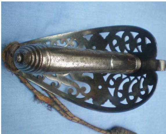
Plate 20. Heavy Cavalry circa 1840 (cf. Plate 15).