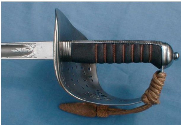
Plate 3. Infantry, circa 1905.