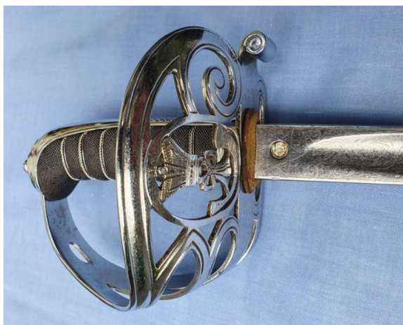
Plate 46. Type 6, circa 1892.