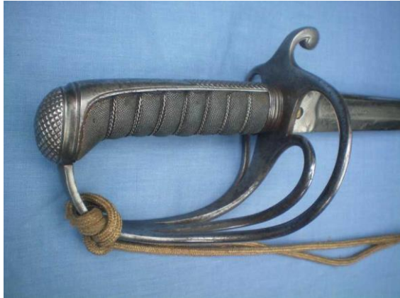
Plate 22. Light cavalry, circa 1865.

Pommel is frequently, but not always, chequered for cavalry and some corps swords. The thumb-rest is usually chequered, and as the century progressed this feature generally became longer to encompass more of the backpiece towards the pommel.