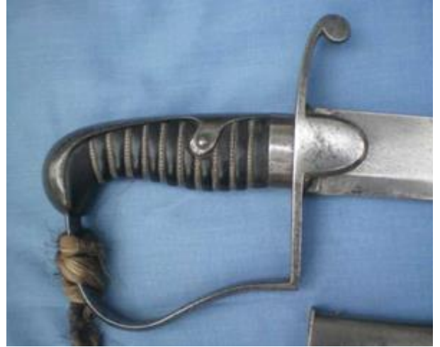
Plate 8. Light cavalry. Faceted ferrule and backpiece with 'comma' ears.