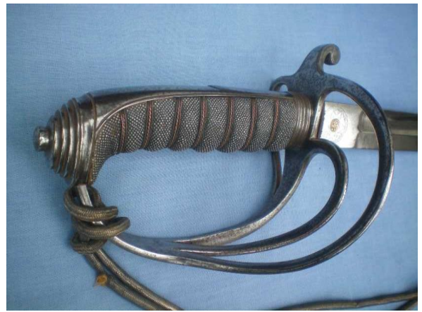
Plate 19. Royal Artillery circa 1850.