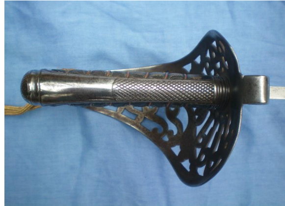
Plate 23. Heavy cavalry, circa 1870.