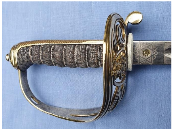
Plate 41 (RAMC).