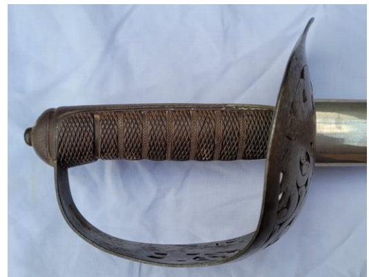
Plate 62. Infantry