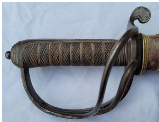
Plate 61. Royal Artillery