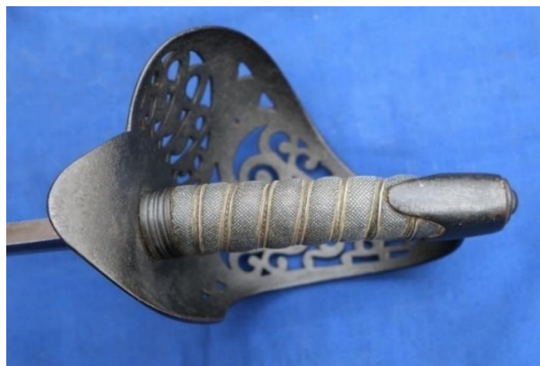
Plate 58.

Many European and US swords dating from the periods discussed above incorporated cap-pommels, but it is extremely rare to find them on British swords. However, they were utilised on a small number of regulation and semi-regulation swords, such as for the Honourable Artillery Company and the 4 th Royal Irish Dragoon Guards (plate 58), but I have observed others that are clearly one-off 'special order' swords, made to the specific preferences of a particular officer. Wilkinson referred to this form as a 'French' pommel.