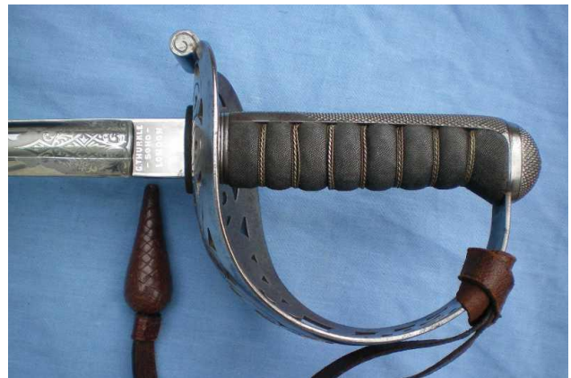
Plate 4. Universal cavalry, circa 1900.