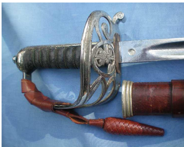
Plate 48. Type D.