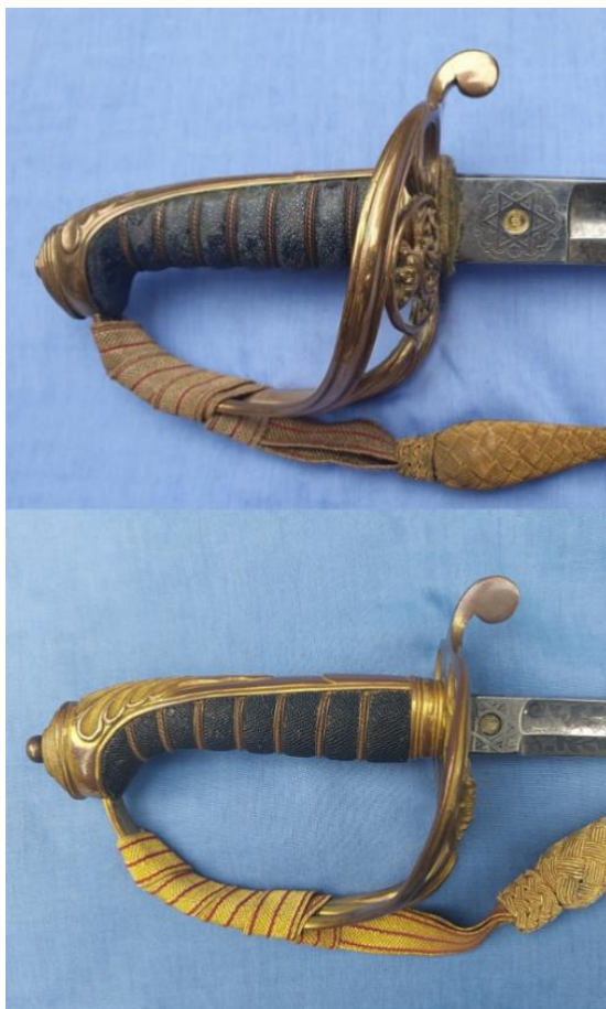
Plate 68. Pattern 1845 Hilts