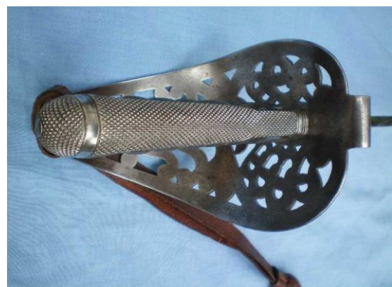
Plate 26. 'Universal' cavalry pattern, circa 1900. No tang button.