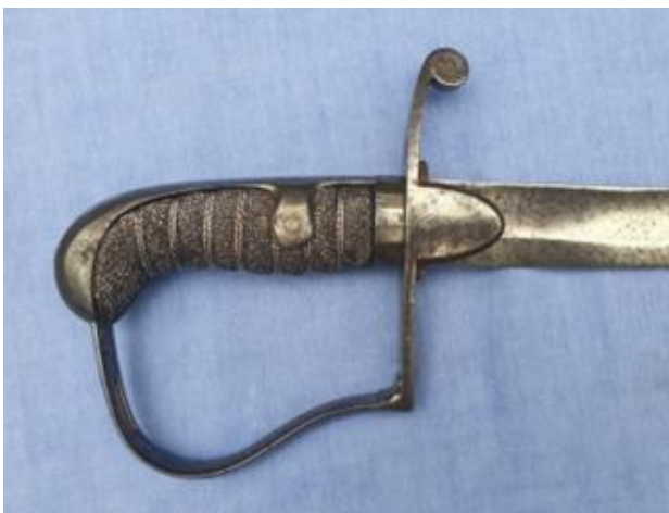
Plate 9. Light infantry. Faceted backpiece with 'teardrop' ears.