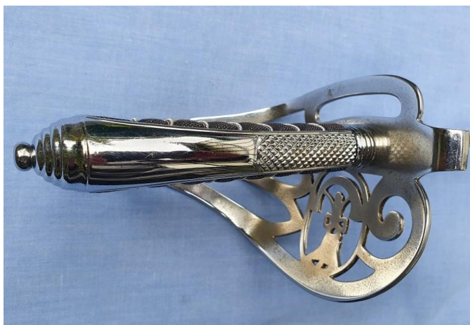
Plate 47. Type 6, top view.