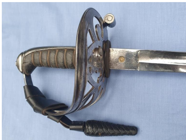
Plate 45. Type 5, circa 1860.