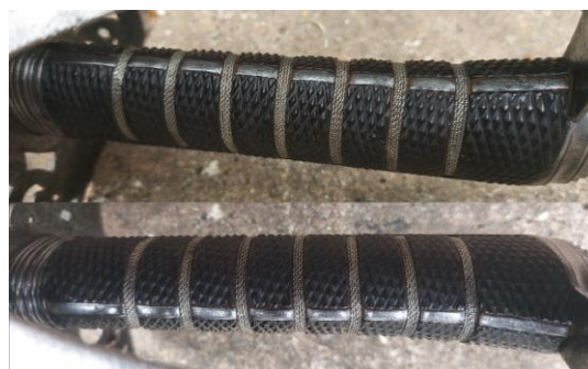
Plate 63. Underside of Patent grip