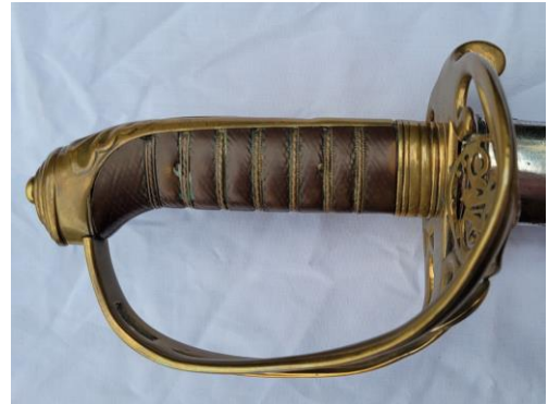
Plate 60. Infantry