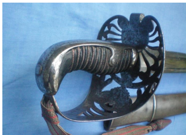
Plate 11. Heavy cavalry. Faceted backpiece with 'comma' ears.