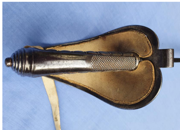
Plate 24. Heavy cavalry, circa 1860. Note stepped pommel and presence of tang button.