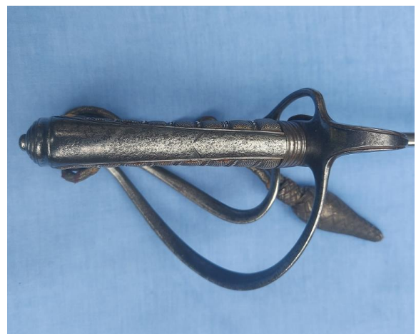
Plate 15 (cf. Plate 20).