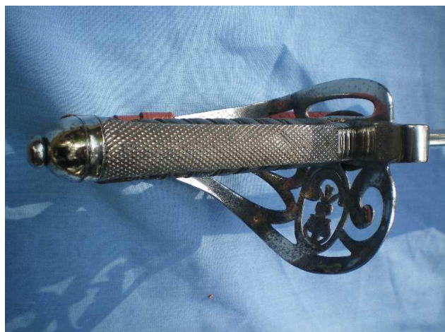
Plate 49. Type D, top view.