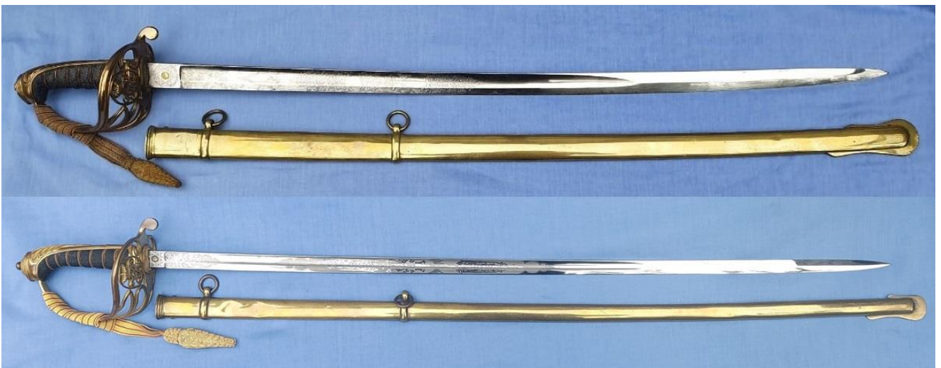
Plate 67. Pattern 1845 Infantry.

Lightweight versions of many standard patterns exist, and these swords are variously referred to as picquet weight or levee swords. They were intended to resemble an officer's full-size service weapon and were intended to be worn when the bulkier and heavier service sword was not required. Examples of these non-standard swords have not been included above as, when compared to regulation examples, they are invariably narrower and lighter in every respect except length. Four example swords are illustrated below for comparison; the upper one in each picture is the standard pattern, and the lower one its equivalent levee version.