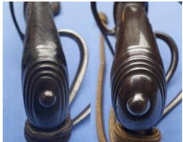
Plate 21. Types 4 and 5 pommels.