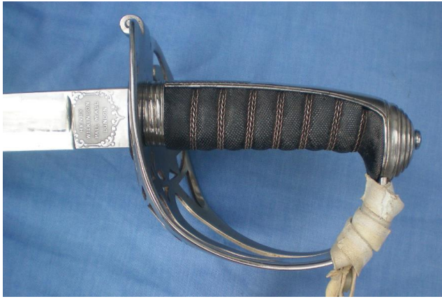
Plate 1. Infantry (Foot guards), circa 1854.