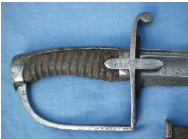
Plate 5. Light cavalry officer, dated 1793.

Narrow and tapered, smooth back, and often with broad flat-topped teardrop shaped pommel with a small projecting point (or 'nib') at the narrow end, as may be observed on the two examples below. Thumb-rest (forward part of the backpiece) is plain. A ferrule is not always present. Note – heavy cavalry officers' swords of this era were of 'basket hilt' form and usually had no backpiece, the grips being near-cylindrical in section and entirely covered with shagreen or leather, and wire-bound.