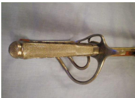
Plate 25. Army Service Corps, circa 1905. No tang button.

Chequered backpiece and pommel. The area of the thumb rest is usually flattened to aid grip, the remainder of the back being rounded. Often found with no tang button, the peened end of the tang being incorporated into the chequering (Plate 25). However examples exist wherein the peen was left visible, and was merely smoothed and polished (Plate 26). Royal Artillery officers' swords usually had a stepped pommel with tang nut, but examples of plain domed pommels are not uncommon. Note that cavalry officers adopted an entirely different form of hilt in 1912, but the Type 7 continued in use for artillery and some corps officers' swords.