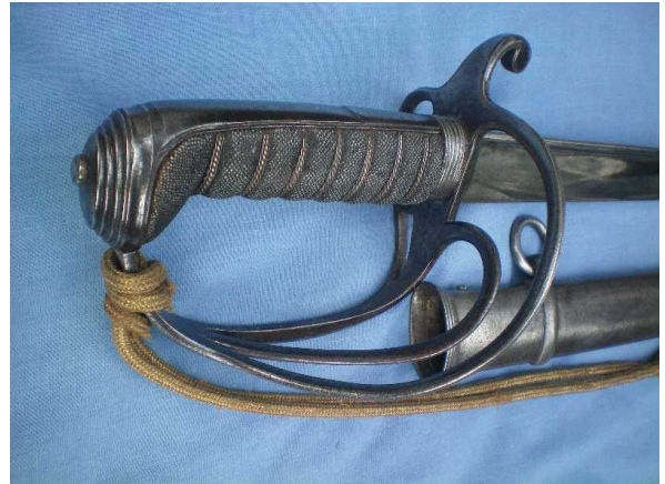
Plate 17. Light cavalry, circa 1840.