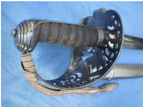
Plate 18. Heavy cavalry, circa 1850.