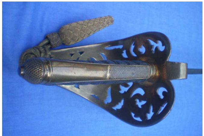
Two Royal Engineers swords. Plate 52 circa 1860, and plate 53 circa 1880.