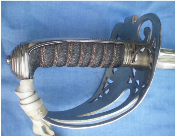
Plate 50. Foot guards, circa 1854.

Foot guards officers were given a new sword in 1854, up to which point they had also carried the standard infantry patterns of 1822 and, later, 1845 (see plates 30-37). The hilt was in steel, and the backpiece was similar to Type 5 and Type 6 with stepped pommel, and the thumb-rest was usually chequered. A tang nut was generally present. This form of backpiece was also replaced by the Type D circa 1895.