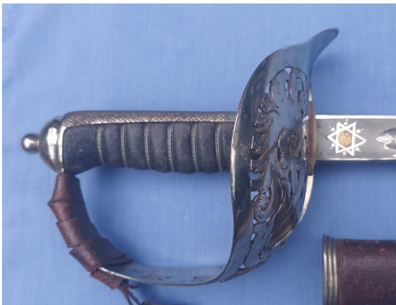
Plate 40 (infantry).

Straight back with chequering overall, but with plain domed pommel and annular fluting at the base. The area of the thumb rest is usually flattened (see Type 7 above).