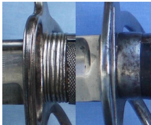
Plate 57. (close-up of ferrules)