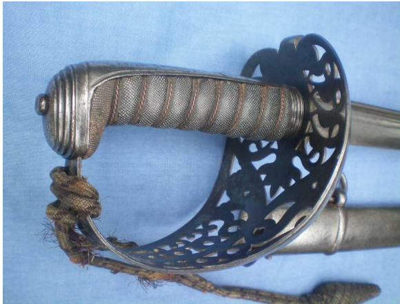
Plate 16. Heavy cavalry, circa 1835.

The back is generally wider than Type 4, and the pommel broader, rounder and deeper (plate 21). The pommel 'steps' are also usually more pronounced ('steeper') than Type 4 examples. Plain thumb-rest. Period of use is known to overlap with Type 6.