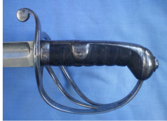
Plate 56. Cavalry trooper's hilt